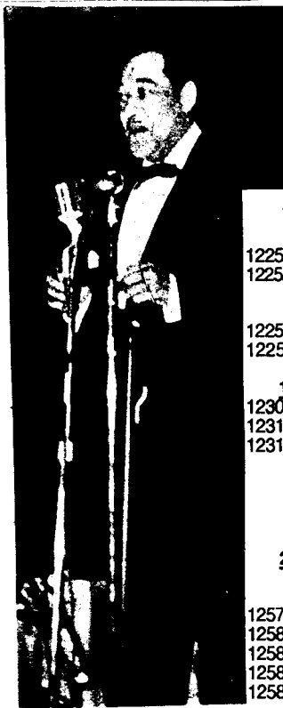
Duke Ellington introduces some of the tunes from his new Cap album, "Ellington '55," to the audience at recent Gene Norman jazz concert.